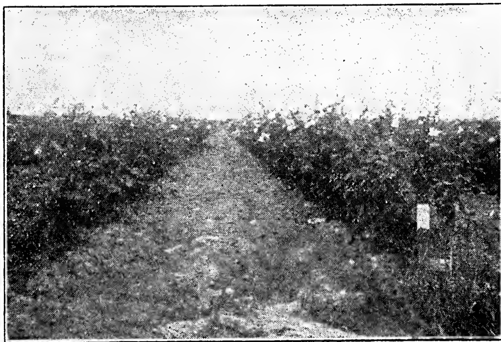
Intensive cultivation as shown above is responsible for the wonderful growth of the famous Locke Roses

Talisman —Deep gold and scarlet buds open to large full flowers of supreme beauty.